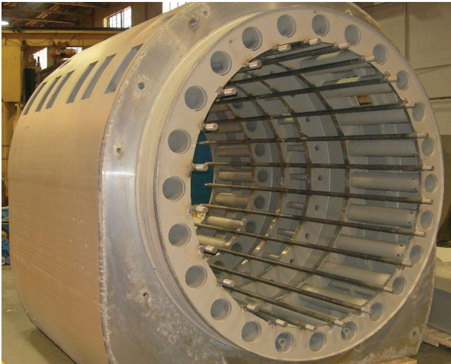
Stator frame center fabrication.

Generator stator frame construction isolates normal core generated double frequency vibration from the foundation and distributes airflow to provide uniform temperatures in the core.