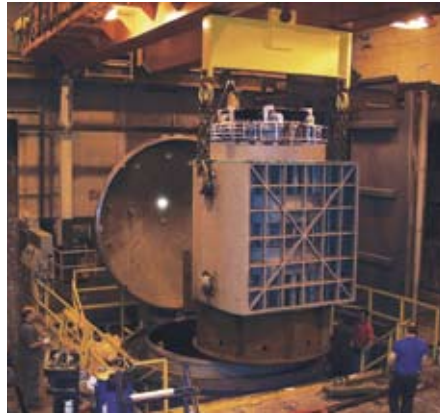
Wound stator entering the VPI tank for impregnation.