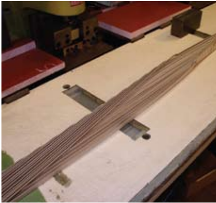
Fabrication of a half loop stator coil with Roebel transpositions.