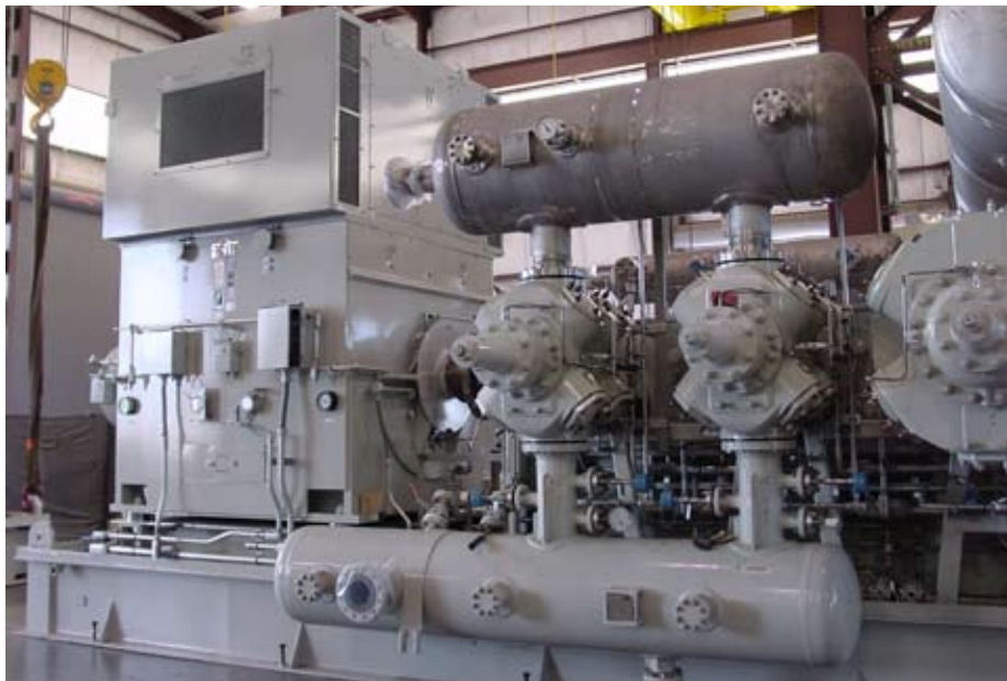
Synchronous motor driving a reciprocating compressor.

Converteam Electric Machinery (EM) synchronous motors for reciprocating compressors provide dependable operation and are built to meet design parameters from compressor manufacturers along with on-site electrical requirements.