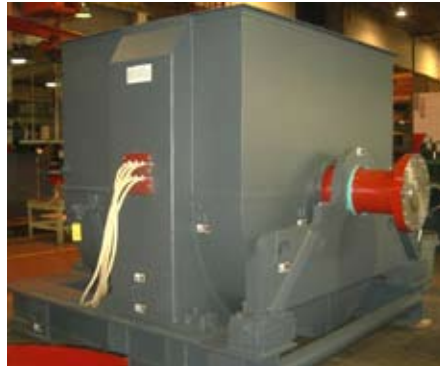
Baseplate with shipping cradle on flanged end.

The brushless excitation system eliminates periodic brush and collector ring maintenance and replacement. Solid state excitation components are rated conservatively to provide dependable service and long life. Converteam EM's Sync-Rite™ system applies the field automatically at the proper rotor angle to ensure smooth synchronization.