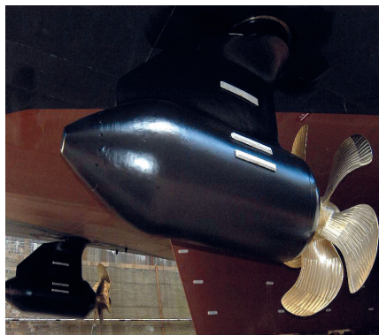
| 2 pod units 7MW each