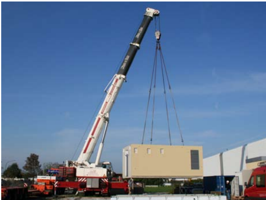
| ProSolar Power Station as container solution

Consistently boosting the performance of electrical systems is an extremely important factor when it comes to meeting the increasing economic requirements placed on the efficiency of photovoltaic power plants. Converteam is an established partner of customized electrical solutions for state-of-the-art power electronics applications that meet the highest requirements in terms of availability, economic efficiency and grid stability.